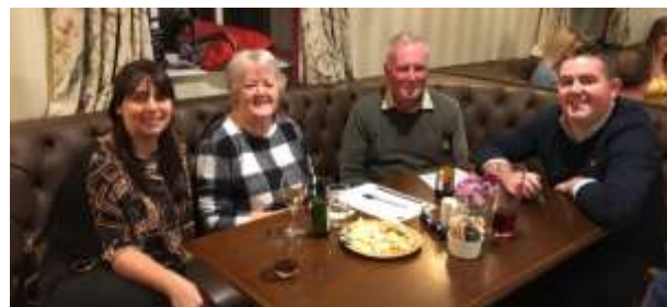
The winning team – appropriately named And the winner is! Congratulations!